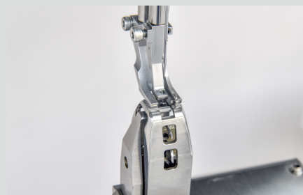
有单针机型和双针机型可选择 There are single needle and double needle models to choose from.

DK-858-1 单针机型 DK-858-2 双针机型 DK-858-1 single needle model DK-858-2 dual needle model