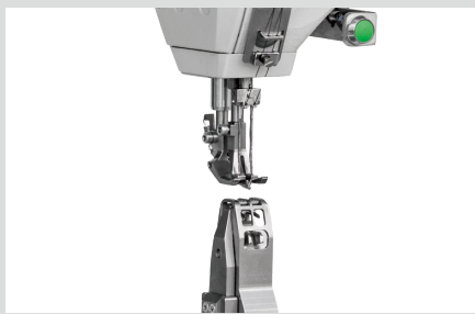
超小缝纫底座，轻松缝纫窄小物件的立体转角 Ultra small sewing base, capable of easily sewing narrower three-dimensional corners.