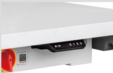
电动升降机架，能精准调节最符合操作的高度 The electric lifting frame can accurately adjust the height that is most suitable for operation.