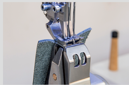
三同步送料系统，送料稳定精准 Triple synchronous feeding system ensures stable and precise feeding.