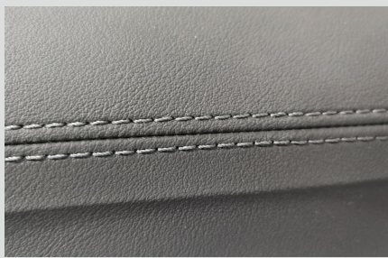
完美双链式线，线迹更立体，针孔更小 Perfect double chain line, with more three-dimensional traces and smaller pinholes.