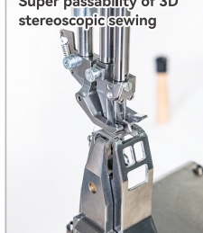
3D立体缝纫的超强通过性 Super passability of 3D stereoscopic sewing